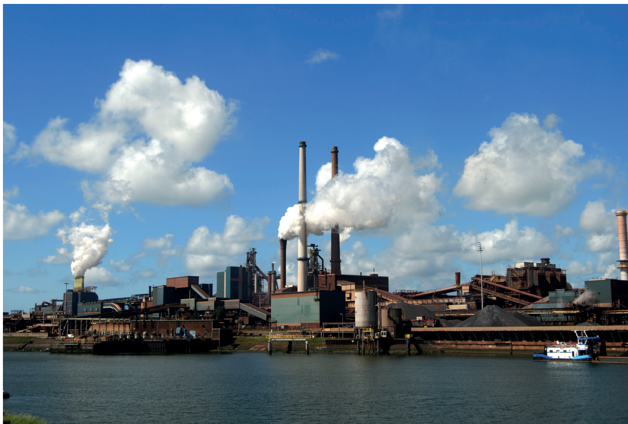
Photograph of a steelworks

Permission to reproduce items where third-party owned material protected by copyright is included has been sought and cleared where possible. Every reasonable effort has been made by the publisher (UCLES) to trace copyright holders, but if any items requiring clearance have unwittingly been included, the publisher will be pleased to make amends at the earliest possible opportunity.