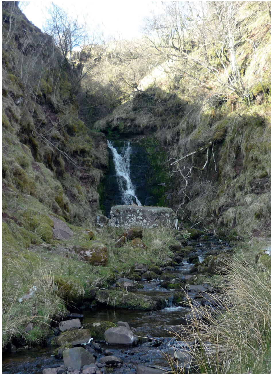
Part of a river valley