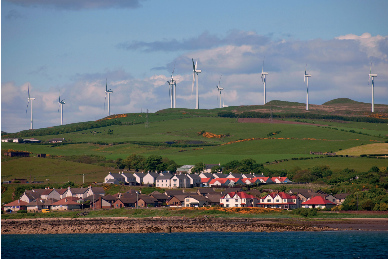
Fig. 6.1 for use with Question 6