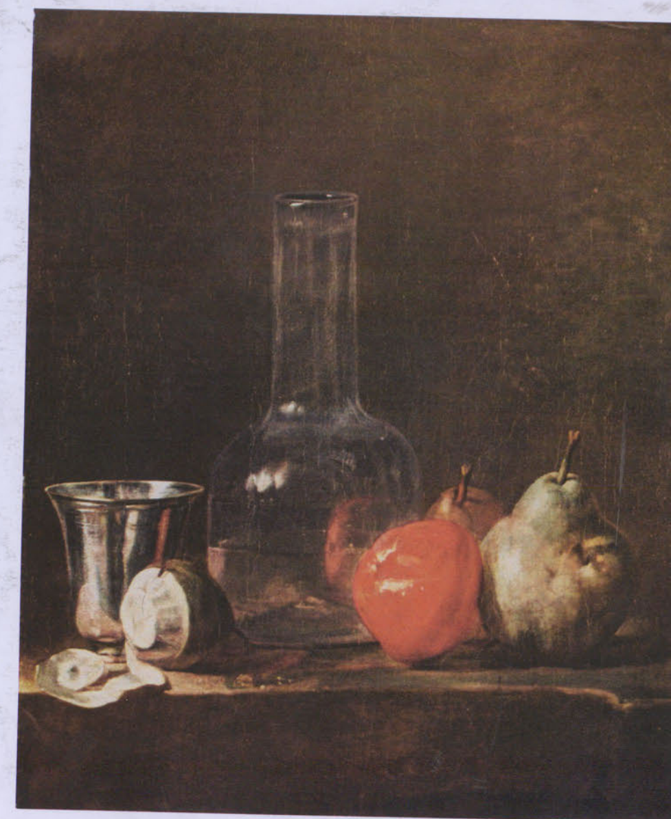
Jean Baptiste Simeon Chardin - Still Life 1756